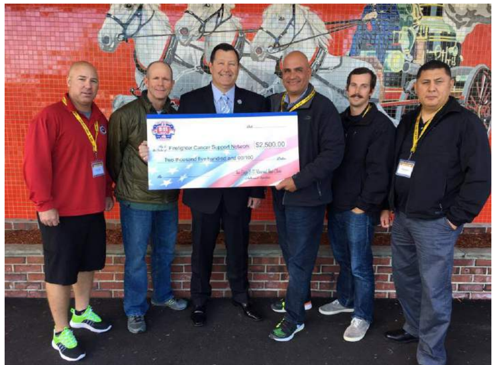
Below: Presenting a donation check to the Firefighter Cancer Support Network on behalf of the SD911MSC.