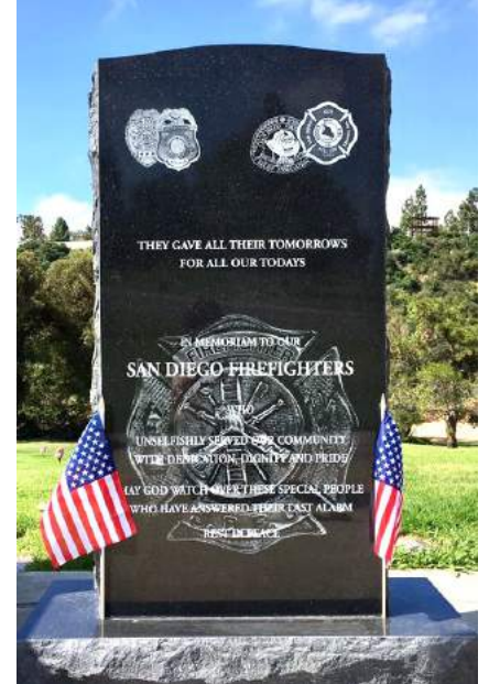
Fireman's Rest at El Camino Memorial Park.

Don't forget...you can receive $50 per year as a gym membership reimbursement. So there's no excuses for breaking your New Year's resolutions! ☺