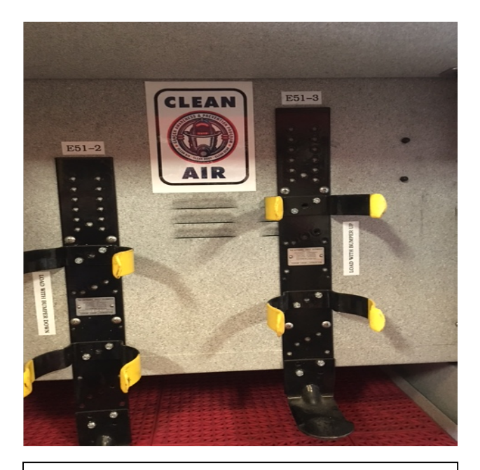
5"x7" "Clean Air" Near SCBA mounts. Sticker on aluminum plate screwed to bulkhead.