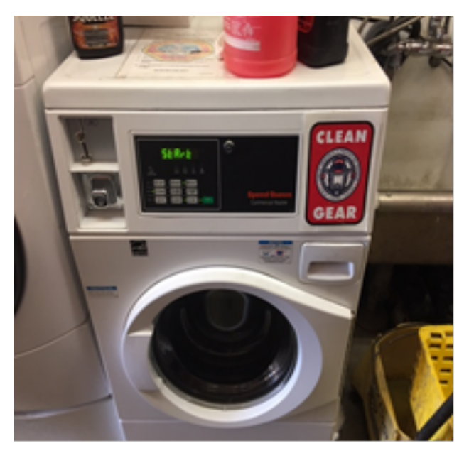
5"x7" "Clean Gear" sticker on washers.